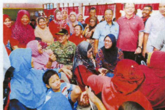
Defence Minister Datuk Seri Hishammuddin Hussein with flood victims in Segamat, Johor, yesterday.

As at 2pm yesterday, there was no evacuation at the affected areas in